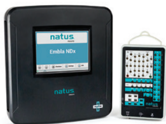
Advanced neuro-sleep monitoring with Embla NDx