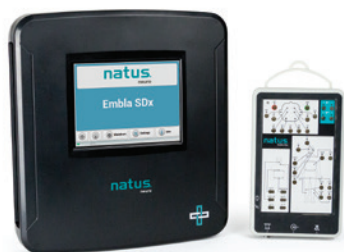
Standard sleep testing with Embla SDx