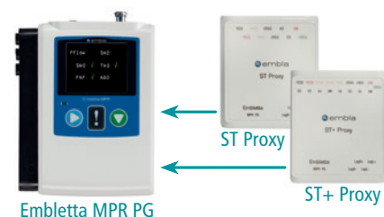
Now integrated with Embletta MPR Scalable Sleep System